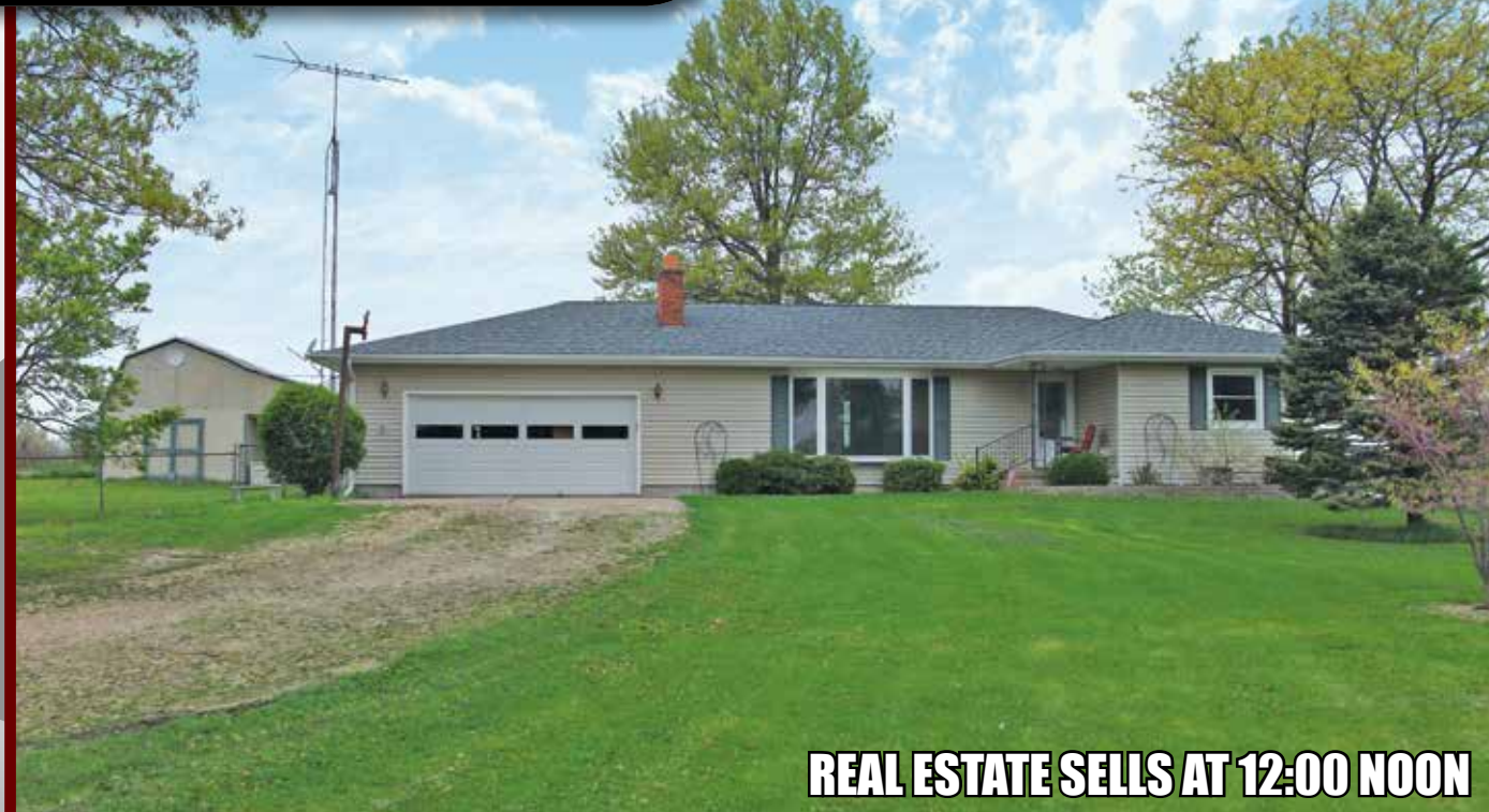
REAL ESTATE SELLS AT 12:00 NOON